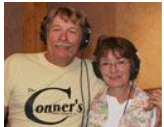
The Conner (Country, Gospel, Bluegrass) Plays from 6pm to 7pm