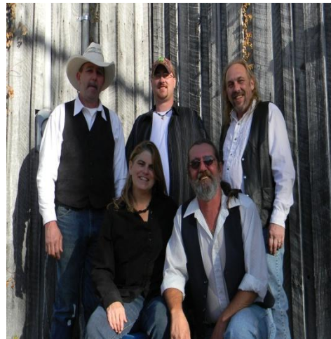
The Lost Road Ramblers (Country, Bluegrass) Plays from 3pm to 5pm